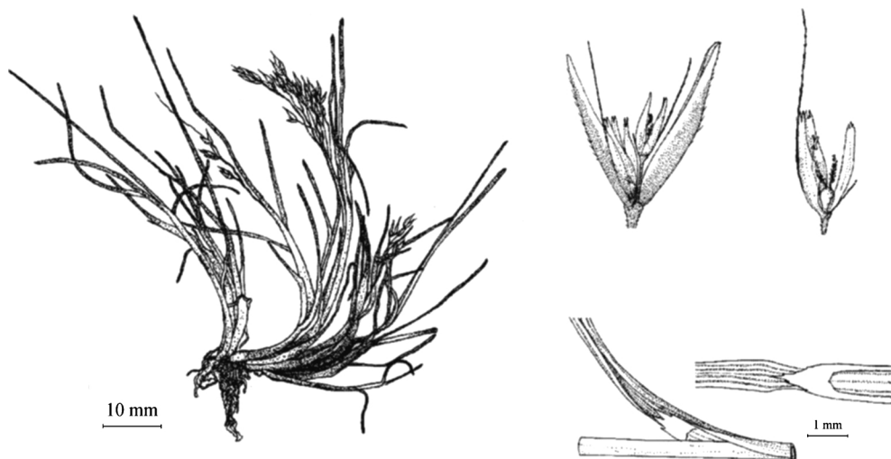
Fig. 1. Deschampsia antarctica DESV (H. Galera).

The AFLP technique was performed according to the procedure described by Vos et al. (1995) with minor modification (Bednarek et al. , 1999). Briefly, 250 ng of genomic DNA was digested with Eco RI and Mse I, and ligated to the appropriate adaptors. A pre-(weakly selective) amplification step was performed in the presence of primers with